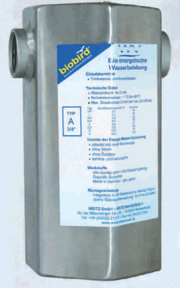
Dimensions available: 3/4" to 4".